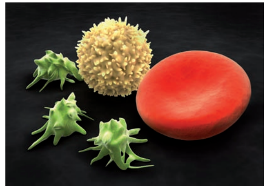
Fig. 17 Erythrocytes, Leukocytes, Thrombocytes

Azath, Acetyls-ac, Cisplat, Carbam, Chlorpr, Cortiso, Halo, Penic, Strep-p, Both, Crot-h, Lach, Phos, Rad-br, Sal-ac and Methion.