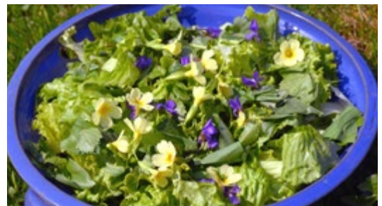
Fig. 5 Edible blossoms