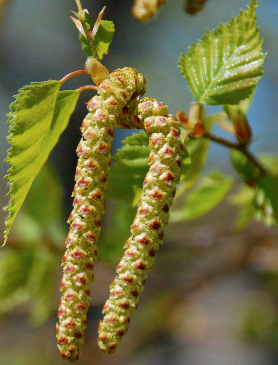
White/Common Birch (Eng), Bouleau Blanc (French).