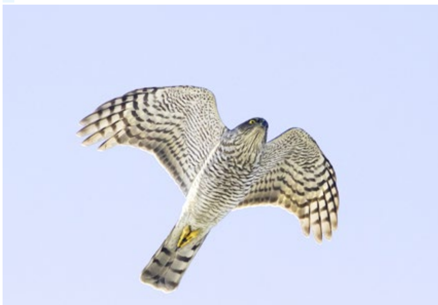
Eurasian sparrowhawk ( Accipiter nisus )