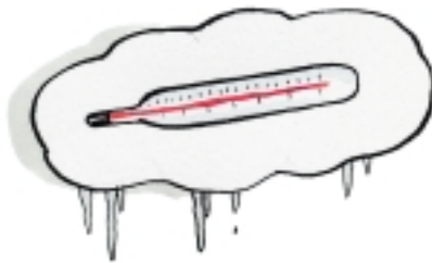
■ high fever alternates with chills