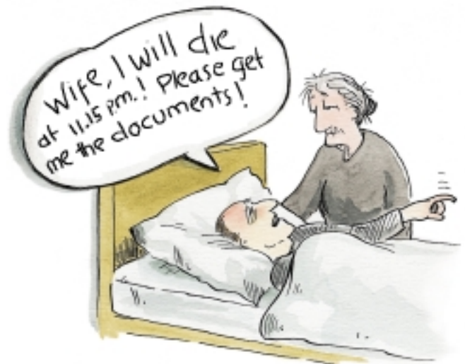
■ predicts the time of his death