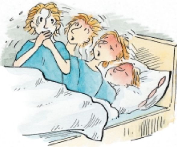
■ wakes up one to two hours after falling asleep, with strong fright