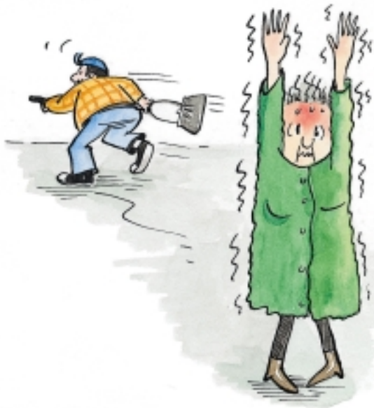
■ ailments from fright