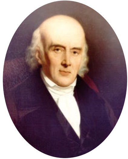
Samuel Hahnemann (1755–1843)

I’m a homeopath, but not a gardener – which is why I’m adding a word of encouragement for all future “homeopathic gardeners”. I have a private garden, and am neither a gardener nor a botanist. Forty years ago, I could barely tell the difference between a young kohlrabi plant and a rose. As you can see, no one is born a master of his art. However, over time all that changed. Gardening is a pleasure for most people, including me (and does away with the need to traipse to the gym).