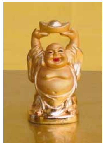
Figure 1, 2 and 3 Hotei