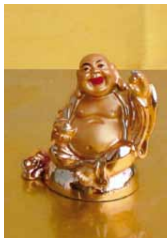
Figure 38 Hotei