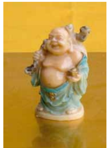
Figure 6 Hotei