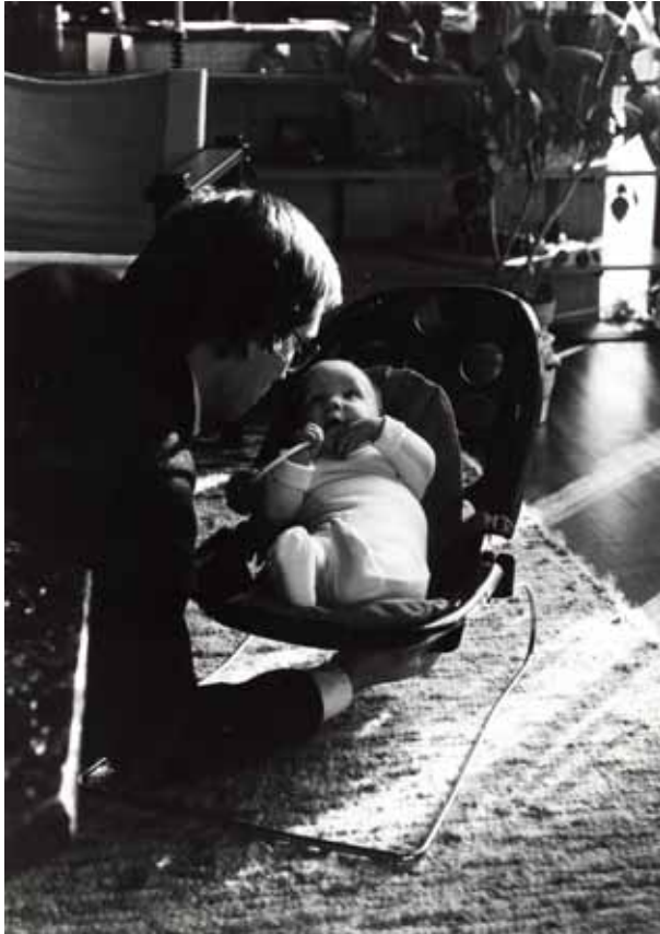
the parent and the baby reflect each other