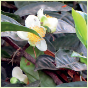
TEA FLOWER FROM TEA PLANTATION IN SRI LANKA

Thea sinensis (Thea) Tea leaves Family: Theaceae