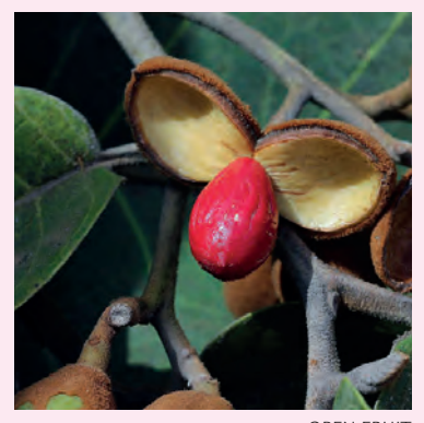
OPEN FRUIT

Virola sebifera ( Myris ) Red ucuuba Family: Myristicaceae