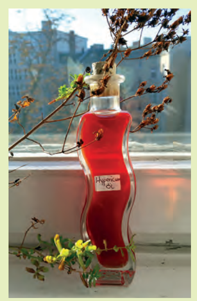
HYPERICUM OIL WITH FLOWERS, BERLIN © MICHAL YAKIR

A medium-size herb, native to Eurasia, though distributed widely by man. Its preferred habitat is recently disturbed, nitrogen-rich soil, but it can survive in a wide range of environments with the ability to store reserves in its root crown which can be called upon during harsh times.