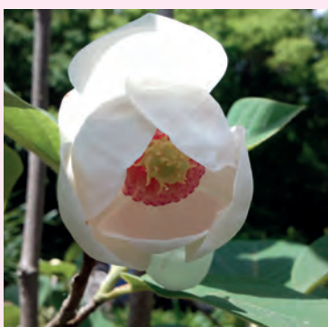
MAGNOLIA BLOOM IN LONDON

Magnolia grandiflora (Magn-gr) Southern magnolia Family: Magnoliaceae