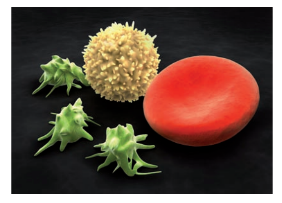
Fig. 17 Erythrocytes, Leukocytes, Thrombocytes

Azath, Acetyls-ac, Cisplat, Carbam, Chlorpr, Cortiso, Halo, Penic, Strep-p, Both, Crot-h, Lach, Phos, Rad-br, Sal-ac and Methion.