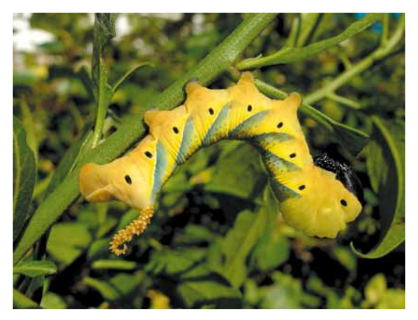
Acherontia atropos - The Death's Head Hawkmoth caterpillar

It is interesting to note the common points between this moth's life cycle and the two existing provings.