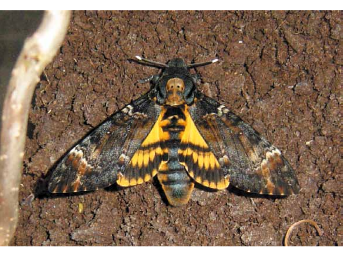
Acherontia atropos – The Death's Head Hawkmoth