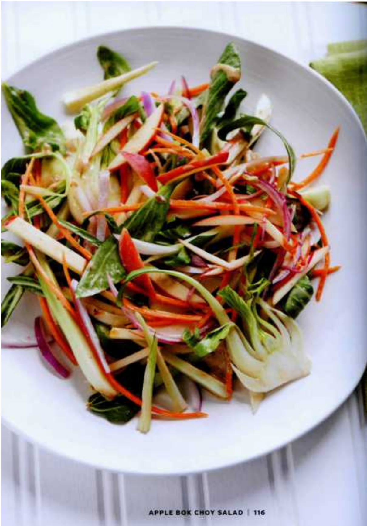
APPLE BOK CHOY SALAD | 116

Excerpt from J. Fuhrman, „Eat to Live Cookbook“ Publisher: Harper One Excerpted by Narayana Publishers, 79400 Kandern, Tel.: +49 (0) 7626 974 970-0