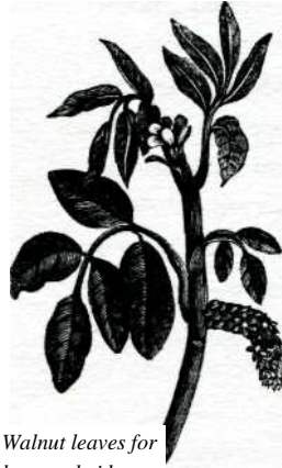
Walnut leaves for haemorrhoids.

A traditional remedy in France employs chestnuts to treat haemorrhoids. Chestnut trees ( Castanea ) were introduced into France from India in the fourteenth century, and there are records of chestnuts being used for circulatory problems from the fifteenth century onwards. The trees' anti-inflammatory properties were identified, and the chestnuts, leaves and flowers were all made into capsules. Here is the recipe for a chestnut cream: