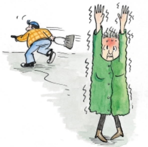
■ ailments from fright