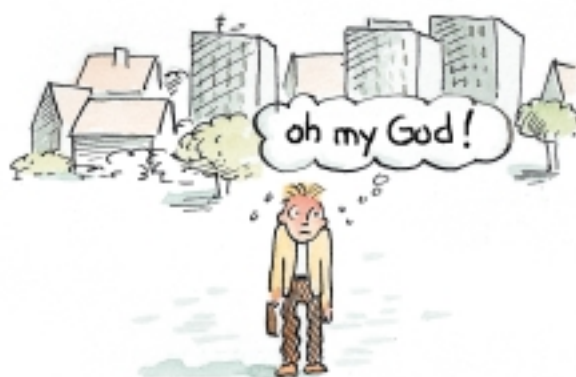
■ fear in large empty spaces