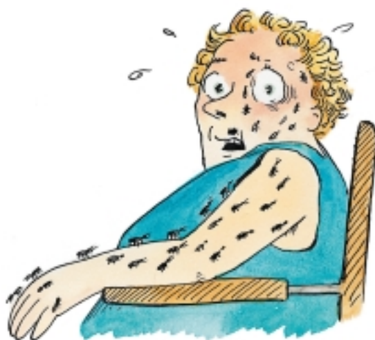
■ formication and sensation of numbness