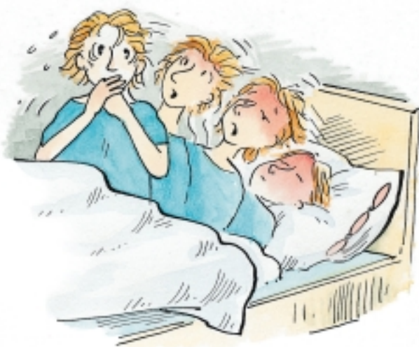
■ wakes up one to two hours after falling asleep, with strong fright