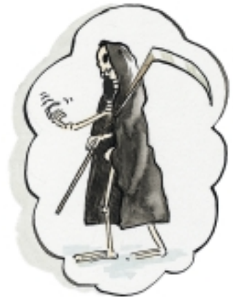
■ feeling of imminent death