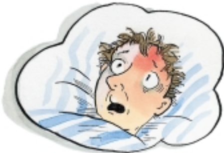
■ red face - or one red and one pale cheek