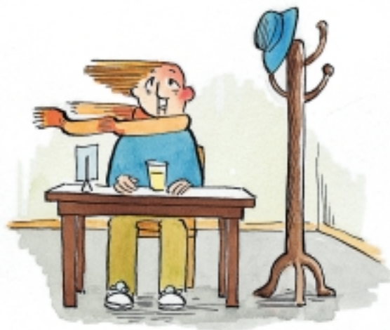
■ ailments from exposure to cold wind