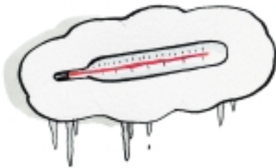
■ high fever alternates with chills