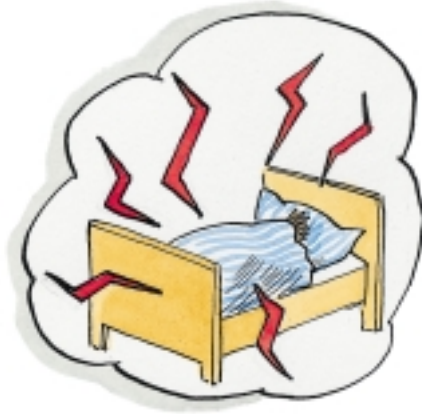
■ strong complaints, accompanied by severe restlessness