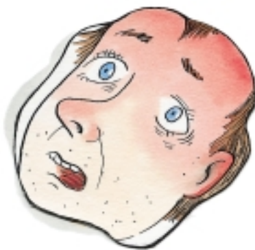
■ beside oneself with pain dry heat contracted pupils