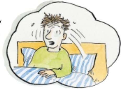
■ the face turns pale upon sitting up