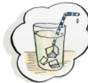
■ strong desire for cold drinks