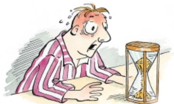
■ panic attacks, accompanied by the conviction that life will end soon