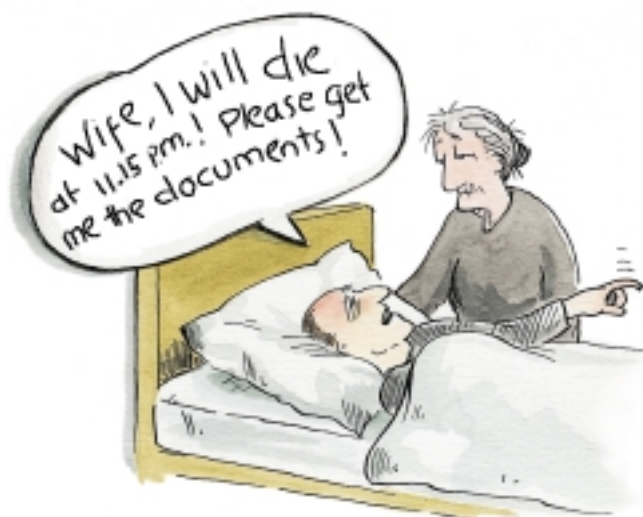
■ predicts the time of his death