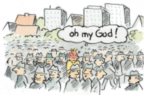
■ fear in a crowd