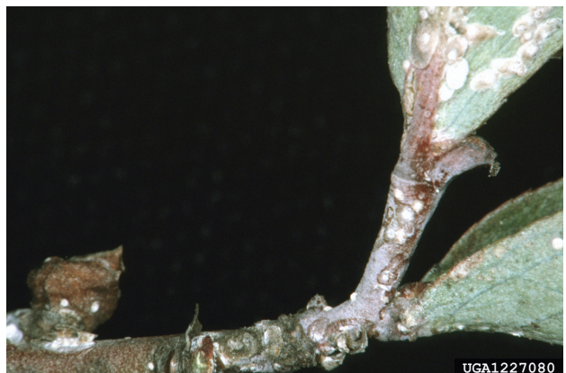
Fig. 59 San José or Putnam scale, Diaspidiotus ancyclus , Infestation