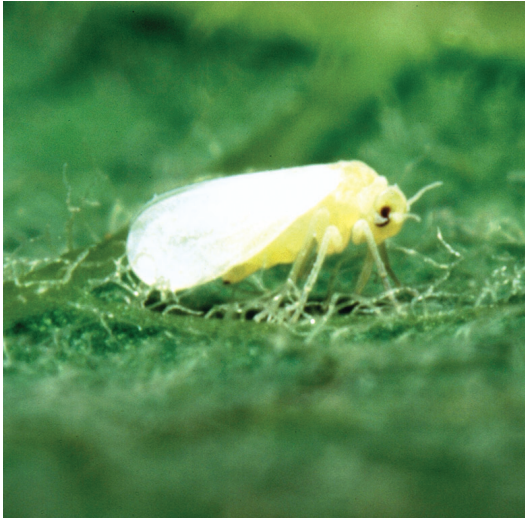
Fig. 57 Silverleaf whitefly, Bemisia argentifolii , adult