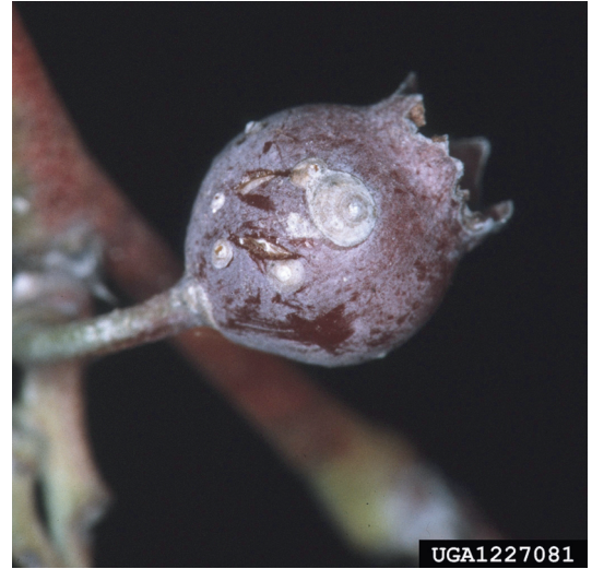
Fig. 58 San José or Putnam scale, Diaspidiotus ancyclus , damage