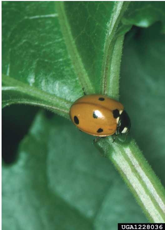
Fig. 55 Coccinella septempunctata , adult

Coccinella either sprayed directly on the aphid or when given to the plant, rapidly reduce aphid populations.