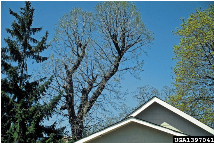
Fig. 127 Incorrect pruning