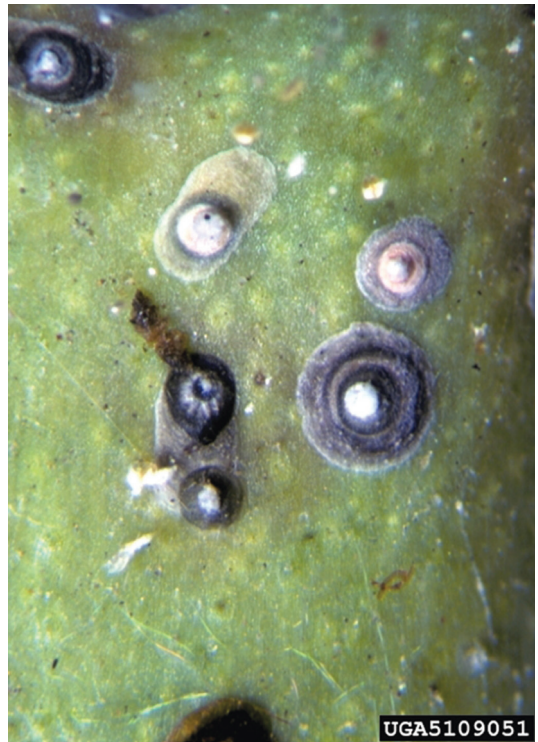
Fig. 56 San José or Putnam scale, Diaspidiotus perniciosus , adult, on almond

Cochineal. Dactylopius coccus . Order: Hemiptera . Family: Dactylopiidae . Trituration of the dried bodies of the female insect.