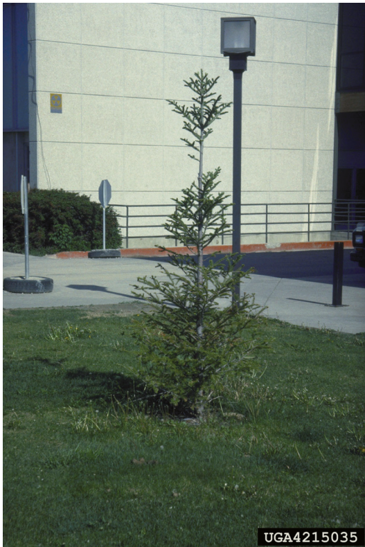
Fig. 123 Transplant shock, planting

Weeping wounds after pruning. Water Arnica in on the roots. Rotting grafts, tumours on old wounds, especially on large trees where large limbs leave big scars. Scar tissue soft and spongy with rotting pulp underneath. Swellings hot, hard, shiny, red, bluish or yellow spots. Yellow spots caused by bruises or disease, eruption of small raised spots as in yellow rust.