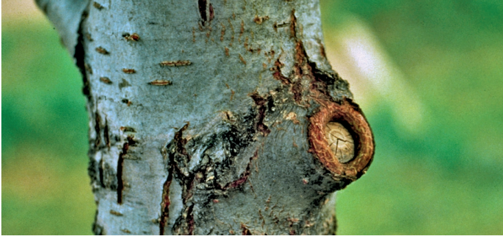
Fig. 124 Damage caused by pruning