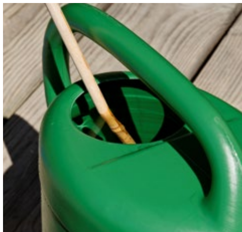
Fig. 1.7e: Stirring the water thoroughly.