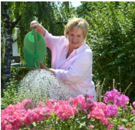
Fig. 1.7f: Watering foliage and root area.

If the plant’s condition improves, you don’t need to give it any more of the remedy. You will only have to repeat the treatment if the plant succumbs to the same disease in the same way.