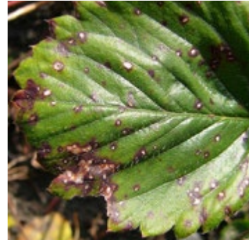
Fig. 3.20: If the problem is common leaf spot, you will notice that the spots have a white centre – this is not found with leaf scorch.

Treatment and prevention: Remove affected leaves and dispose of them in plastic bags. Ensure the plants are not too close together and avoid applying excessive amounts of nitrogen fertiliser as both these factors can encourage the fungus. Dispose of any runners. Avoid planting the same plants in the same place in successive years. Mixed cultures and garlics or onions are beneficial.