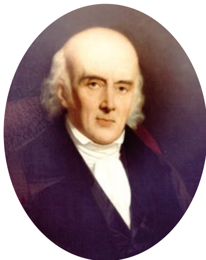
Samuel Hahnemann (1755–1843)

I’m a homeopath, but not a gardener – which is why I’m adding a word of encouragement for all future “homeopathic gardeners”. I have a private garden, and am neither a gardener nor a botanist. Forty years ago, I could barely tell the difference between a young kohlrabi plant and a rose. As you can see, no one is born a master of his art. However, over time all that changed. Gardening is a pleasure for most people, including me (and does away with the need to traipse to the gym).