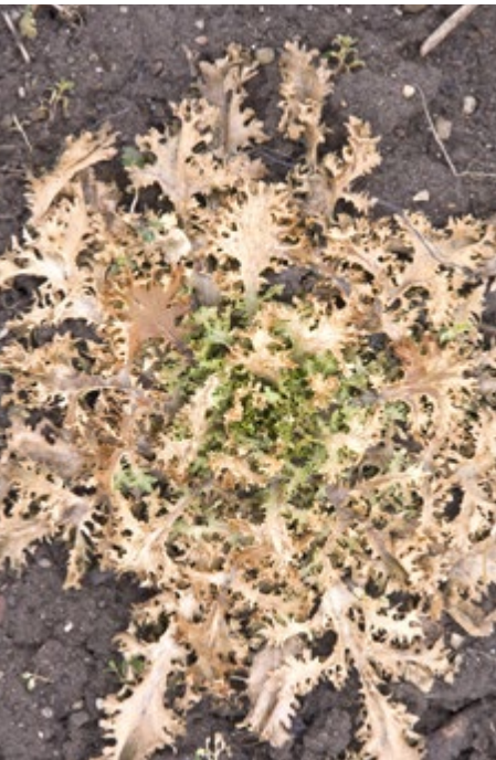
Fig. 4.28: Neglected frisée lettuce