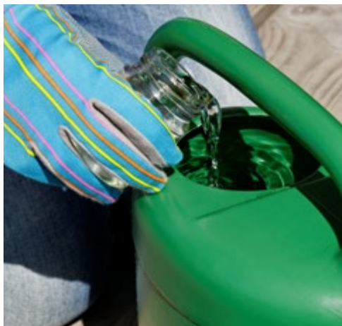
Fig. 1.7d: Mixing the dissolved globules with water.