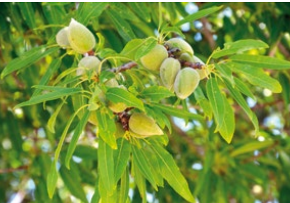
Fig. 6.39: Large bunches of almonds, May 2015.