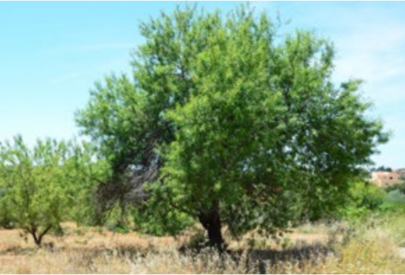
Fig. 6.38: Old but clearly rejuvenated almond tree one year after the first homeopathic treatment, May 2015.