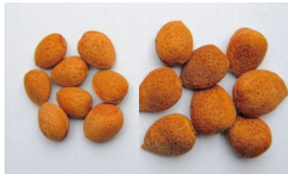
Fig. 6.40: Left: almonds from an untreated tree. Right: harvest from a treated tree.

The difference in the size of the almonds before and after homeopathic treatment is clear (→ fig. 6.40).