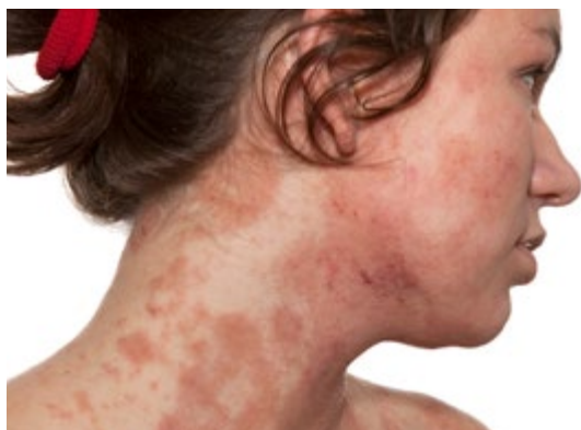
Fig. 11 Neurodermatitis (atopic eczema)

Skin issues always include the immune system and its power to differentiate between the self and others. Nature only allows for subjugation in the case of a fight. In neurodermatitis, the fight is hopeless because healing does not occur by eliminating foods or taking cortisone. A treatment is successful when patients can finally have a fever and sweat again. Consequently, therapy must be conducted through the long path of the destructive carcinogenous layers of the illness through the sycosis and often also through the scrofulous to the psora in order for it to actually leave the organism through the skin. This does not work without conflict resolution in the family system, especially when children are affected. Some parents prefer to bear the disaster of their child's illness instead of recognising the conflicts that are active within them and manifested by the child. On the other hand, it is almost a miracle to experience how successfully neurodermatitis can be healed when everyone involved is insightful and solution-oriented.