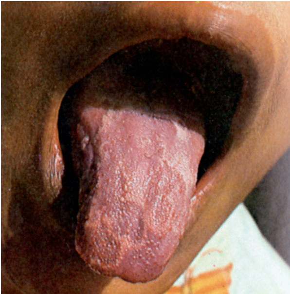
Fig. 7: Cyanosis

con. , crot-h. , Cupr. , Dig. , dros. , ferr. , glon. , hep. , hydr-ac. , hyos. , ign. , iod. , ip. , kali-c. , kali-chl. , Lach. , Laur. , led. , lyc. , mang. , merc. , merc-c. , merc-cy. , mez. , morph. 7 , mosch. , mur-ac. , naja , nat-m. , nat-n. , nit-ac. , nux-m. , nux-v. , Op. , ox-ac. , ph-ac. , phos. , phyt. , pilo. , plb. , psor. , puls. , ran-b. , rhus-t. , ruta , sabad. , samb. , sars. , sec. , seneg. , sil. , spong. , staph. , stram. , sul-ac. , sulph. , tab. , thuj. , Verat. , verat-v. , xan. , zinc.