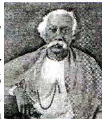
Fig. no. 3.16