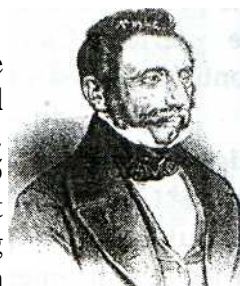
Fig. no. 3.17