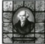
Dr. med. Samuel Hahnemann

Questionnaire for Your Homoeopathic Anti-Miasmatic Treatment