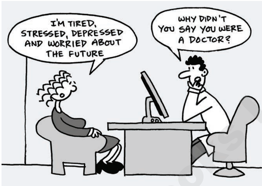
Figure 9.2 A crisis of morale.

and even de-skills the immensely versatile human mind. It deprives doctors of the creativity of mind that is so essential to solving human problems, as opposed to analysing technical ones. This 'cognitive fluidity' is the distinctive attribute of the human mind. Its application, its use in solving complexity, is what the mind is for. It is a doctor's most useful tool. The level of regulation to which it is now subjected is alien to it, and deeply demoralising.