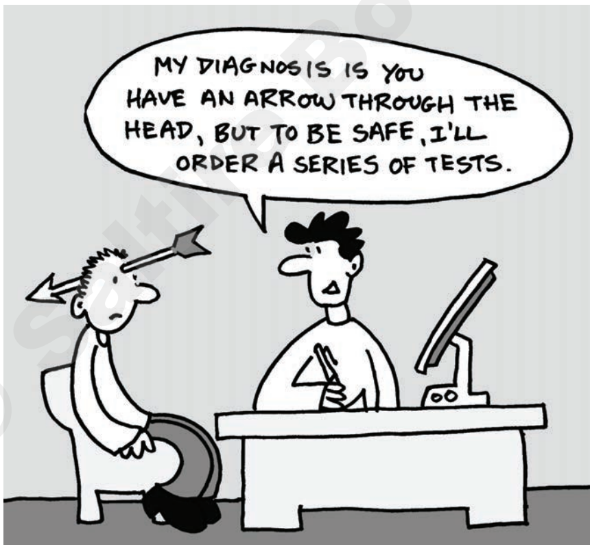
Figure 9.1 The commonest theme was the overuse of diagnostic tests.

Running through these examples is the common thread that has already emerged – the tendency to do things because they can be done and that come to be expected, rather than because they should be done. But one other common theme was the need to 'invest to disinvest' by developing or implementing procedures or processes that could avoid or replace those